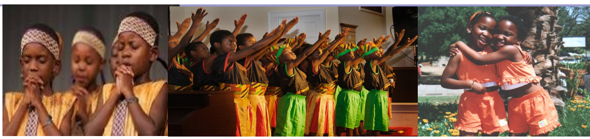
A.L.O.T. VISIONARIES - MISSIONARIES-STAFF MEMBERS

Our staff members are not just volunteers or workers... Every person fills a vital role, in ministry, in service, and in the Body of Christ. We require first that you have a passion for Children's ministry and experience, you desire to change lives through mentoring,, counseling, guiding, caring and loving, praying and believing in the miracle of impacting the next generation ! Once they go through a stringent screening, then the applicants will be interviewed investigated and verified. Our children all over